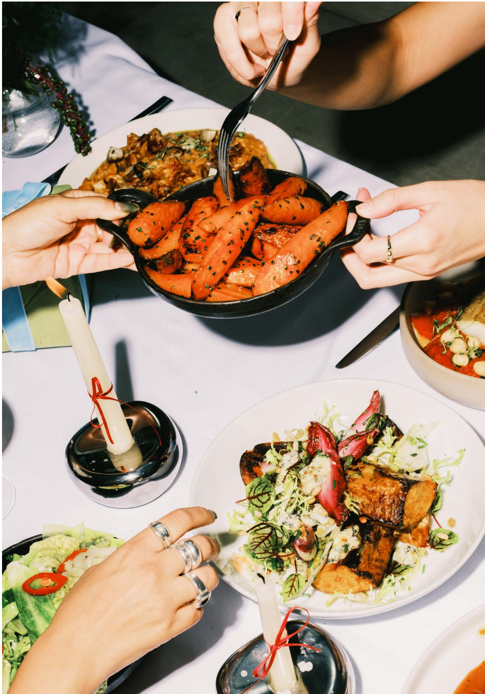
Maple roasted carrots, Roasted spiced butternut squash